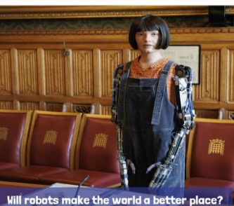
Will robots make the world a better place?